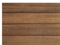
Vulcan Sioo:x As delivered