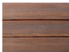
Vulcan Teak As delivered